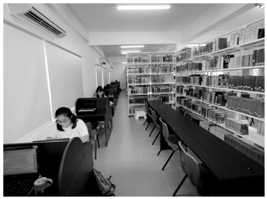
▲ View of Main Library with Study Carrels (L-block, 2nd storey, 9A Gilstead Road)