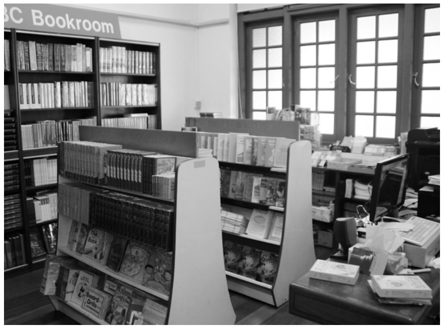
▲ New FEBC Bookroom at Beulah House