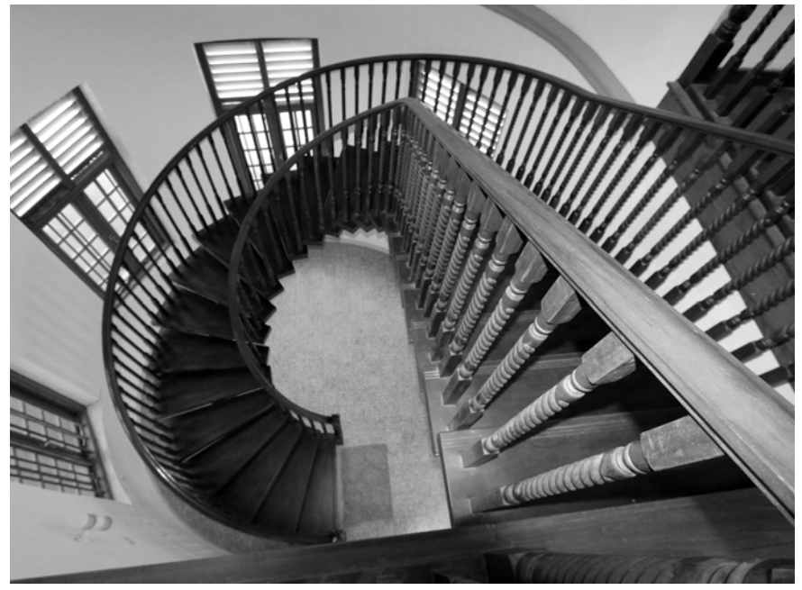
• Spiral Staircase to 2<sup>nd</sup> Storey of Beulah House