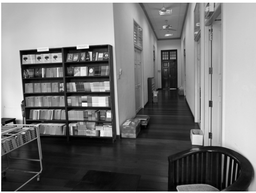
• View of 2<sup>nd</sup> Storey inside Beulah House