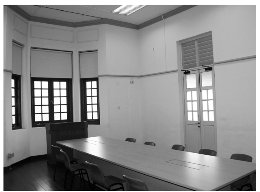
▲ New Conference Room at Beulah House