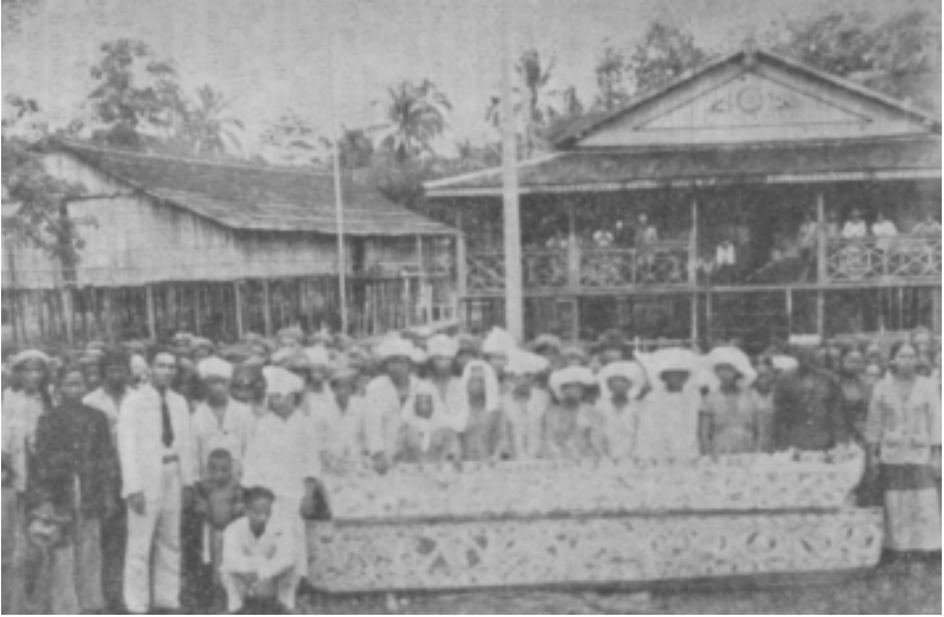
A Dyak Christian Chieftain's funeral

not connected with the Faith, lest we be misunderstood by the Government officials, these people would pay us the respect and regard us truly as “royal uncles”. Although the chieftain’s son succeeded his father, we were still regarded as officials. We were consulted for any important matter affecting the people. When the chieftain’s son ascended his father’s throne it was through us that the blessing was given at a grand ceremony. Notwithstanding, the work we did was smashed by Satan in a few years. Alas, what bitter reminiscences!