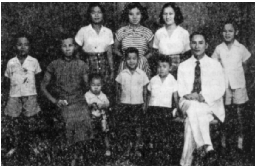
The Gui Family of interior Borneo