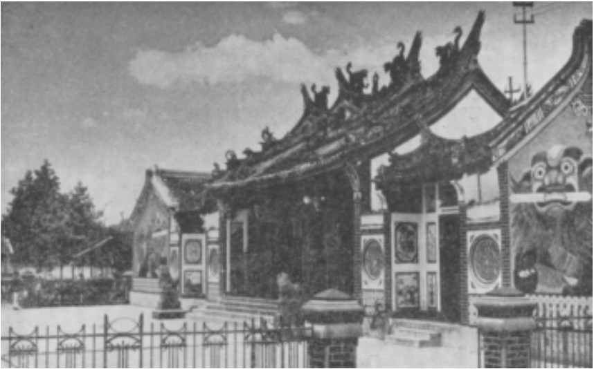
A Chinese Temple