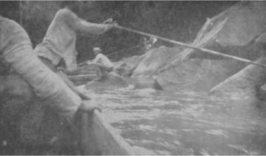
Working our way through the rapids

hours (of sailing), – they hurriedly wrapped the hog’s head with a stone in some old clothes and let it slide silently into the river, like burying a dead man. Thereby was the boat rid of that awful stink.