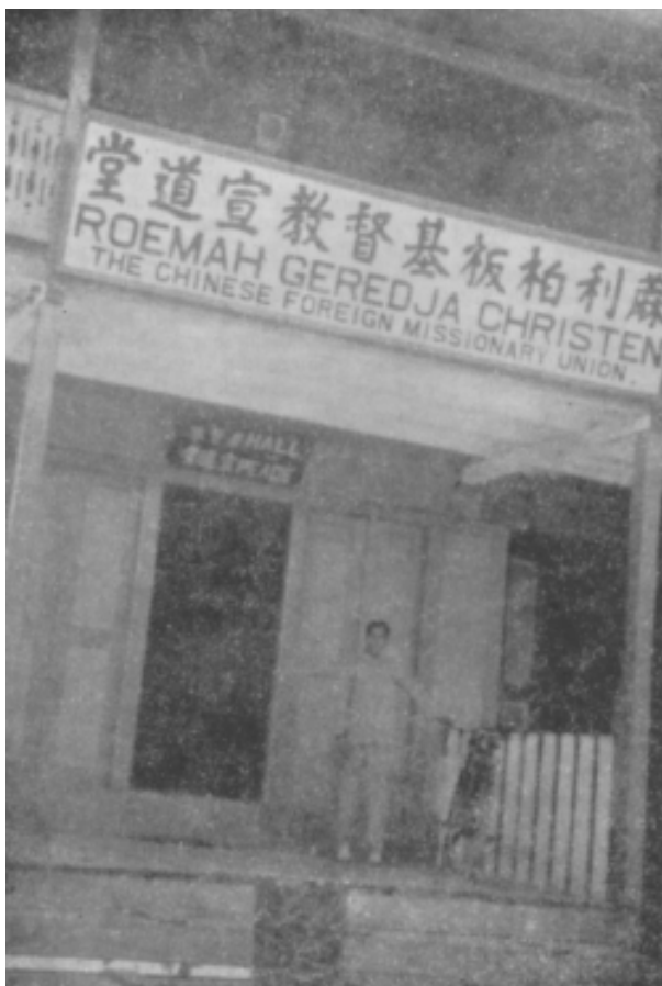
Our second base of operations – Balik Papan

we would “enter the tiger’s lair” to strike up friendship with them as well as to understand their sentiments, custom and taboos that thereby we might obtain our quarry.