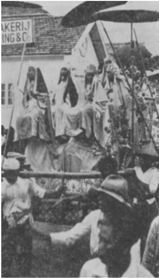
Chinese New Year's Night Procession

lanterns and firebrands in all its dazzling grandeur. Though an annual event, the cost was considerable. But after the procession, the next day saw the town sink back to a quiet humdrum life again.