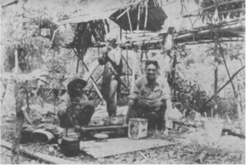
Our jungle hotel

that time I was the only one lightly laden. The rest were weighed down. So I shared her burden of responsibility. I carried the three year old girl on my back. In one stretch we went over hill and dale, through thick spear-like undergrowth over a once-beaten track, in the slashing rain. We were all reduced to drenched fowls, head to foot, while the raindrops on the eye-brow made us appear all tears. Most unbearable was that little girl on my back who sobbed all the way. This experience stirred up a hundred feelings in my heart. It made me recall that famous rhyme of a psalm, “Tearful sowing, happy reaping.”