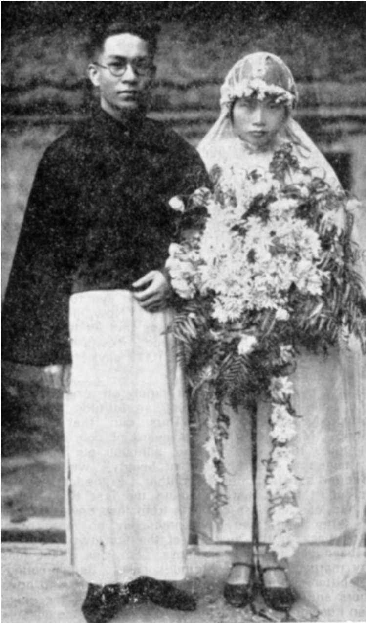
"A laborious couple"