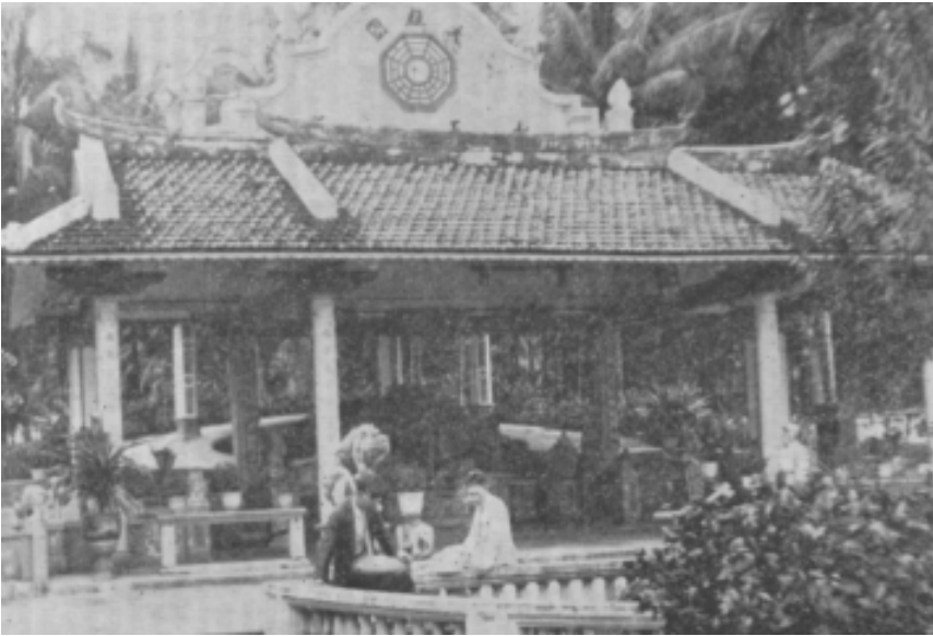
A Chinese mausoleum

their tombs. For example, the famous tombs amongst them are of the Koh family in Djakarta and of the Tang family in Makasar. But these Chinese officials became an extinct race upon Indonesia's gaining independence. Not only were their official titles abolished but also such small offices as "head of a street," or household, formerly held by the Chinese. Those dazzling mansions are now rented out or sold, and many have become the offices of Chinese associations. Like "white clouds making dogs in the sky," like "the sea now turned into a mulberry field," this changing world can only bring one regrets.