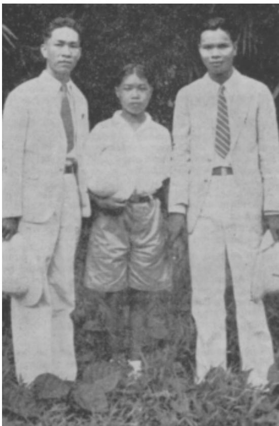
White khaki and topee

the virtue of the people excelled in “obedient following”. Thus, the hoary-headed had no recourse but to submit to the young chieftain. We took this to be an opening to our mission. As the saying goes, “Shoot the horse to get the rider; catch the robber-chief to catch the thieves”.