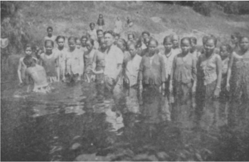
They believed and were baptised

back of the Lodge. Seeing this sudden change of demeanour, we became completely nonplussed.