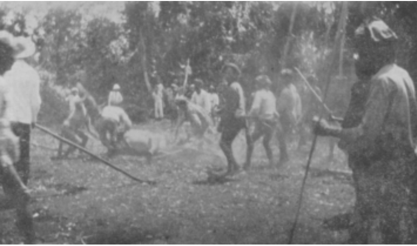
Spearing down an ox for "Pilihan"

hunting stems from furtive murder originating in revenge, or lucre. Head-hunting, however, is now a thing of the past.