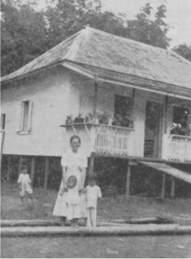
Our jungle headquarters

nomadic life, nor do they cultivate. The other tribes having had contact with outside peoples have become quite civilised. So, apart from those who have grouped in cultivated settlements, it would be difficult to control them, the Punan for example. Nevertheless, though these are a nomadic people, few disturbances to the peace have come from them.