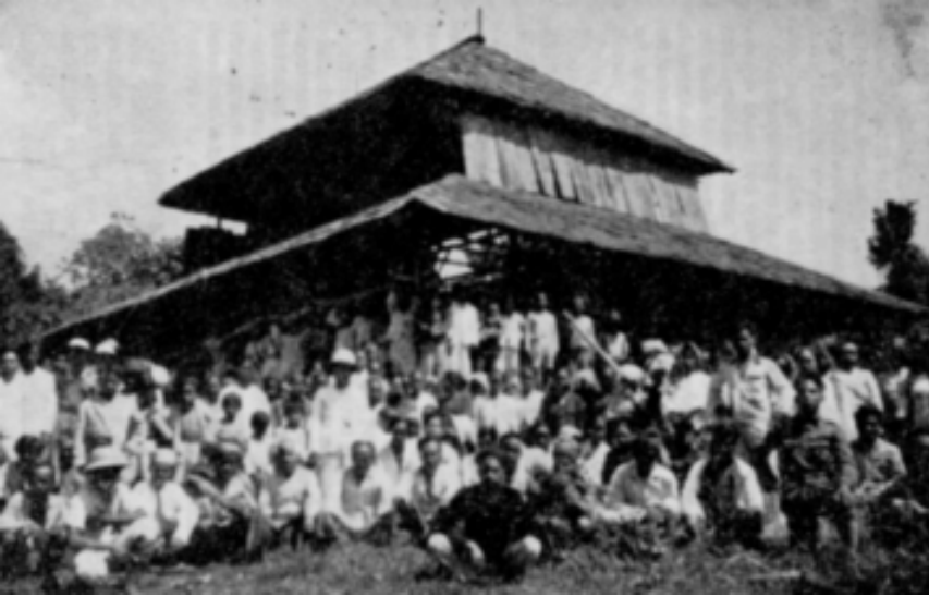
A chieftain's house turned into a Church

Churches of this district. Henceforth they would take on the proper image of a church-district and no more remain an evangelism-district – a new image of organisation and order. During the conference the people seemed to have awakened to a new reality as they spontaneously exclaimed, “This is it!” On Christmas Eve we held a big welcome meeting. The next morning was the Christmas Service. Every Church was represented by a choir, properly dressed and attired. The atmosphere of the Service was solemn. After service we baptised twenty-nine men and women. In the evening we had a Christmas party at which 50 items were lined up on the programme, including some well-acted plays. This was a first in the history of the Dyak Church.