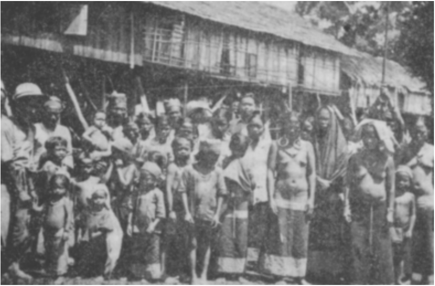
The first Dyak village we visited

sons of nature, how they spend their days in unending leisure. You could never find a busy man within their midst. If you come to Dyakland you could immediately spot out under the sun a man lying on the ground pillowed on a girl's thigh while she rivets her two eyes on his shaggy long hair – searching lice. This interesting picture tells you a story: They are in the process of spending a peaceful, leisurely day. Yes, such is the complacent Dyak lifestyle of whiling away the time. We know that contentment is the mother of simple living. So, when they have caught a wild pig the whole family could eat it all up in one night. When meat is scarce they are well satisfied with two meals of chilli-salt. In general, they are more than contented with what meets their daily needs. It never occurs to them what gloom their evening years might bring nor do they worry about the possibility of a famine year. They never practise saving, nor do they know the meaning of “rearing sons for old age” and “storing grain against hunger”. To them