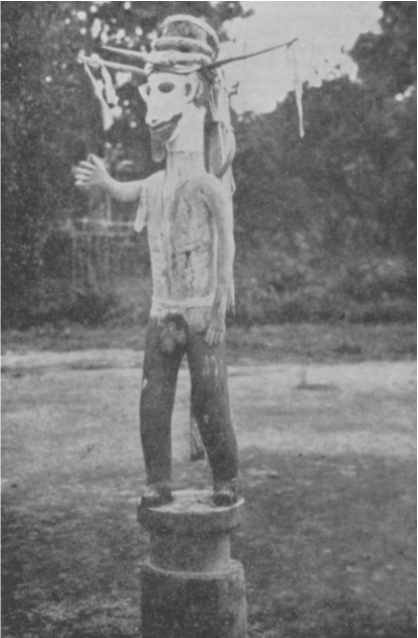
An ox totem, part of the ox-spearing rite