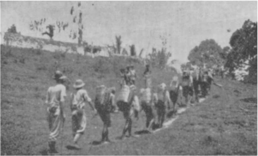
Like an army's expeditionary force

sheets of woven palm leaves. With all this accoutrement, we launched out to Banjarmasin. Though heavily packed, we covered the first six or seven days' rugged journey with ease. We crossed high mountains and lonely valleys, thick jungles whose ancient trees reached up to heaven, their thick foliage blotting out the sun. Thorns, thistles, tall lalang grass overgrew little-trodden foot-tracks. Like sharp spears they stood in the way. The forward man naturally had to hack a way for his comrades behind.