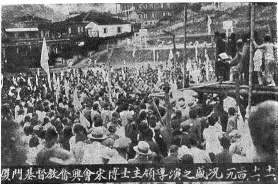
The open-air Revival meetings with John Sung, Amoy, 1934.

I believe the day is coming when we who follow Jesus will meet the Lord mid-air. Thousands upon thousands will meet in the sky. At that hour, Amoy and Kulangsu would disappear. Jesus is the living Saviour. We who follow Him have everlasting life.